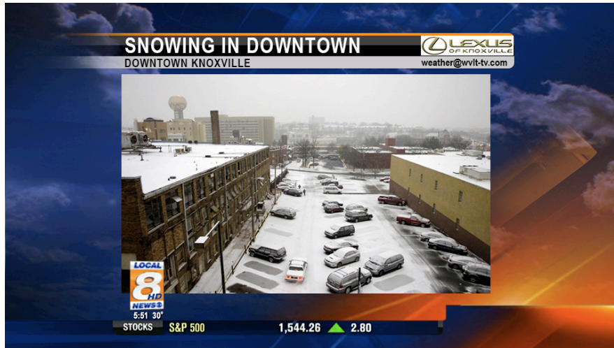
LEXUS of Knoxville