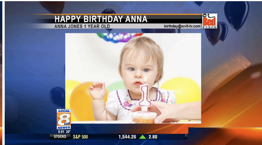
The Bed Store